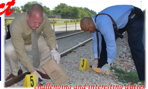
challenging and interesting duties