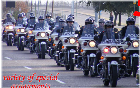
variety of special assignments