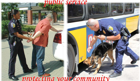
protecting your community

advancement opportunities due to growth related to planned rail expansion