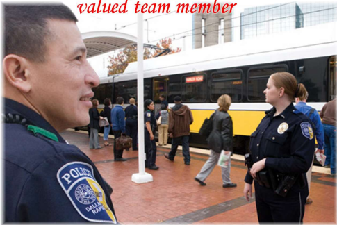
valued team member